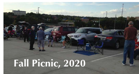
Fall Picnic, 2020

The Congregational Activities Committee met on April 13 and are planning a picnic