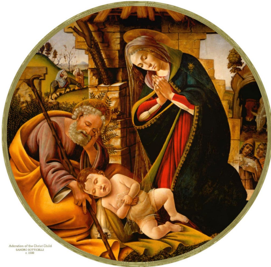
Adoration of the Christ Child SANDRO BOTTICELLI c. 1500